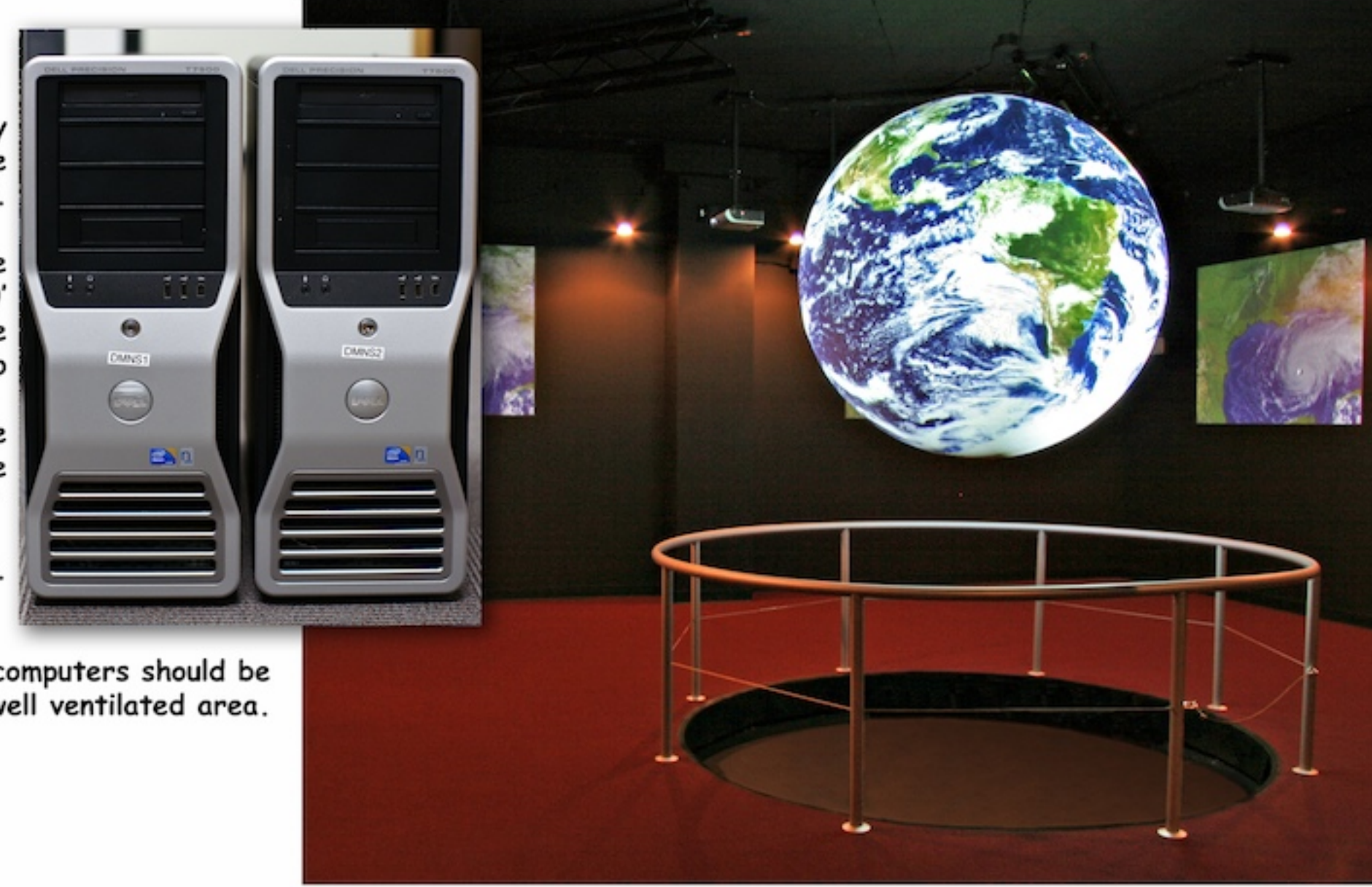
Science on a Sphere® in Planet Theater®, Boulder, Colorado

The computers should be in a well ventilated area.